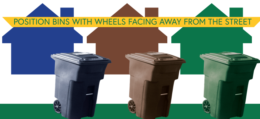
POSITION BINS WITH WHEELS FACING AWAY FROM THE STREET