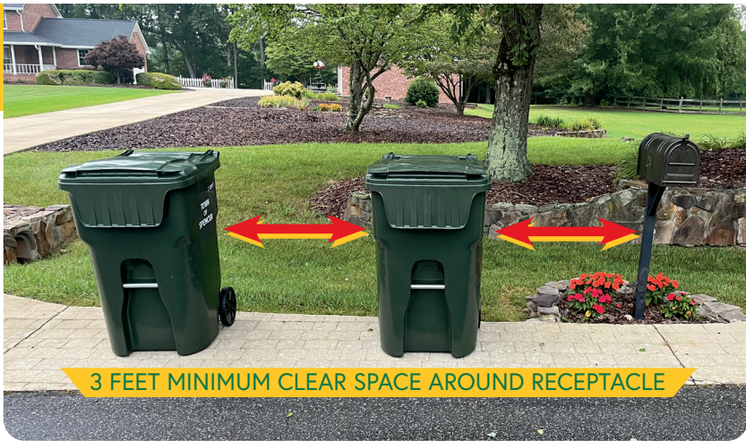
3 FEET MINIMUM CLEAR SPACE AROUND RECEPTACLE